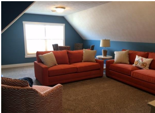
Upstairs living area