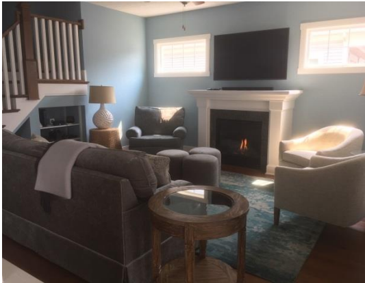
Downstairs living area